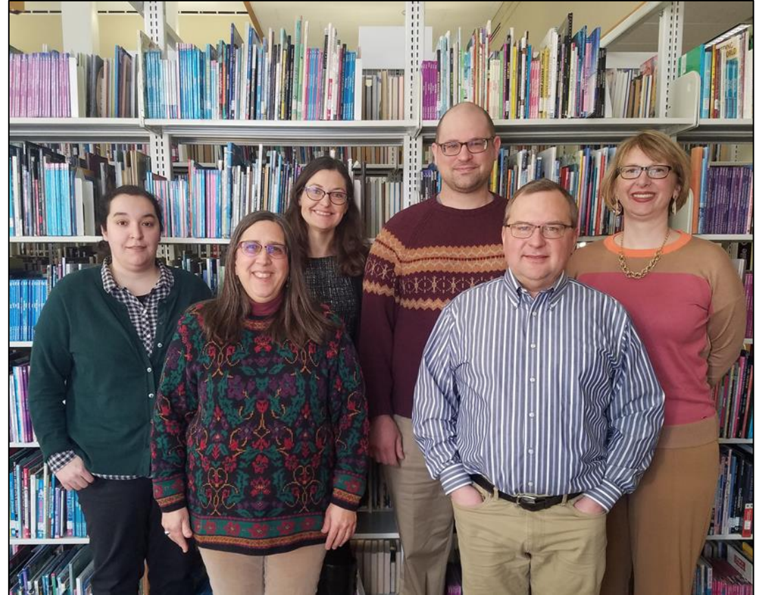
The CSB/SJU Libraries Learning and Research Librarians Team

If you haven't already been contacted, your librarian will be in touch by the end of the week.